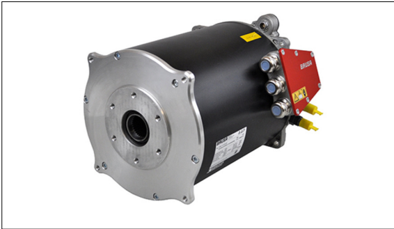
Figure 1: Investigated Permanent Magnet Synchronous Motor (PMSM) www.brusa.biz

Introduction: Electrical machines in automotive applications should feature a high efficiency in order to increase the drive range for a given battery capacity. The wide speed range of the motor is thereby achieved with a voltage source inverter, which is usually designed as a 2-level inverter. The use of different inverter topologies as in the 3-level inverter could bring improvements in terms of motor losses and thus improve efficiency. In this thesis, the influence of different inverter topologies on the iron losses in electrical machines is investigated by comparing the performance of a 2-level and 3-level inverter. The major difference between the inverter topologies is the additional voltage level of the 3-level inverter, which enables a better sinusoidal voltage modulation and thus fewer harmonics in the system. The improved voltage and current quality of the 3-level inverter indicates a possible reduction of the iron losses. Additionally, the iron losses caused by the inverter supply contribute strongly to the total losses and therefore offer a great opportunity for improvement.